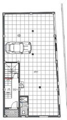
PLANTA SUELO SUPERFICIE: 100,00 M 2